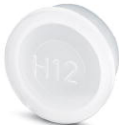
Plastic dust protection cap

The figure shows the product version for M23 circular connectors