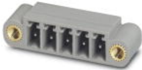
The figure shows the 5-pos. version of the product in gray

Header, Nominal current: 8 A, Rated voltage (III/2): 160 V, Number of positions: 15, Pitch: 3.81 mm, Color: black, Contact surface: Tin, Mounting: Wave soldering