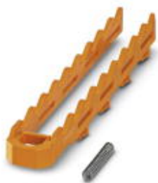
Component housing, length: 99 mm, Lock and Release system, color: orange, width: 16.2 mm

Please be informed that the data shown in this PDF Document is generated from our Online Catalog. Please find the complete data in the user's documentation. Our General Terms of Use for Downloads are valid ( http://phoenixcontact.com/download )