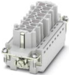
HEAVYCON socket insert, for 830 V (III/3), with 6 N/O contacts and 2 switch contacts, crimp connection

Please be informed that the data shown in this PDF Document is generated from our Online Catalog. Please find the complete data in the user's documentation. Our General Terms of Use for Downloads are valid ( http://phoenixcontact.com/download )