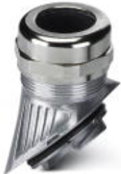
EVO metal cable gland with bayonet locking, B series, size M40, cable diameter: 19 - 27 mm

Please be informed that the data shown in this PDF Document is generated from our Online Catalog. Please find the complete data in the user's documentation. Our General Terms of Use for Downloads are valid ( http://phoenixcontact.com/download )