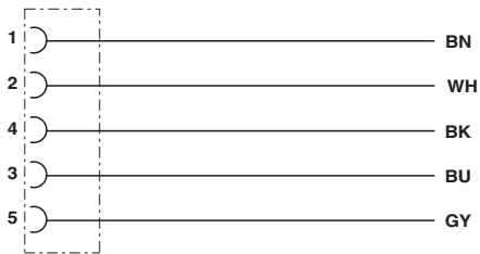
Contact assignment of the M12 socket