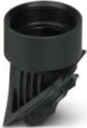
Adapter, plastic, for EVO housing, NPT 1 1/4 inch thread

Please be informed that the data shown in this PDF Document is generated from our Online Catalog. Please find the complete data in the user's documentation. Our General Terms of Use for Downloads are valid ( http://phoenixcontact.com/download )