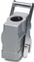
HEAVYCON sleeve housing B16, with main latch, height 76 mm, with 1x M32 thread, straight conductor outlet

Please be informed that the data shown in this PDF Document is generated from our Online Catalog. Please find the complete data in the user's documentation. Our General Terms of Use for Downloads are valid ( http://phoenixcontact.com/download )