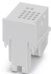
Component housing, length: 111.9 mm, Cover, color: light gray, width: 20.94 mm, height: 16.3 mm

Please be informed that the data shown in this PDF Document is generated from our Online Catalog. Please find the complete data in the user's documentation. Our General Terms of Use for Downloads are valid ( http://phoenixcontact.com/download )