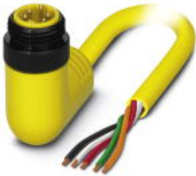
Power cable, 5-position, PVC, yellow, Plug angled 7/8"-16UNF, A - standard, on free cable end, A - standard, cable length: 5 m

Please be informed that the data shown in this PDF Document is generated from our Online Catalog. Please find the complete data in the user's documentation. Our General Terms of Use for Downloads are valid ( http://phoenixcontact.com/download )