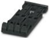
Strain relief, Number of positions: 4, Color: black