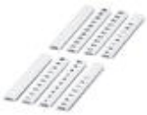
Zack Marker strip, flat, Can be ordered: Strip, white, Labeled according to customer specifications, Mounting type: Snap into flat marker groove, For terminal block width: 5 mm, Lettering field: 5.15 x 5.15 mm

Zack Marker strip, flat - ZBF 5 CUS - 0825025