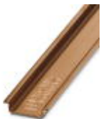
DIN rail, material: Copper, unperforated, height 7.5 mm, width 35 mm, length: 2 m

DIN rail, unperforated - NS 35/ 7,5 CU UNPERF 2000MM - 0801762