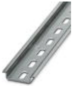
DIN rail, material: Galvanized, perforated, height 7.5 mm, width 35 mm, length: 2 m

DIN rail perforated - NS 35/ 7,5 ZN PERF 2000MM - 1206421