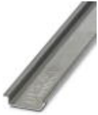
DIN rail, unperforated, Width: 35 mm, Height: 7.5 mm, Length: 2000 mm, Color: silver

DIN rail, unperforated - NS 35/ 7,5 AL UNPERF 2000MM - 0801704