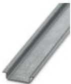
DIN rail, material: Galvanized, unperforated, height 7.5 mm, width 35 mm, length: 2 m

DIN rail, unperforated - NS 35/ 7,5 ZN UNPERF 2000MM - 1206434